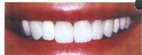
After SYNERGY® Super White veneer